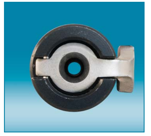
Design allows full flow for quick evacuation and charging. No restrictive small seal or plunger.

Recommended for a range of services including helium, air, water, vacuum, and most refrigerants. The PR is constructed with a heat treated and plated steel lock lever and neoprene seal suitable for temperatures from -20° to 250° F (-29° to 121° C).